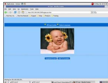
Web Browser of Linux