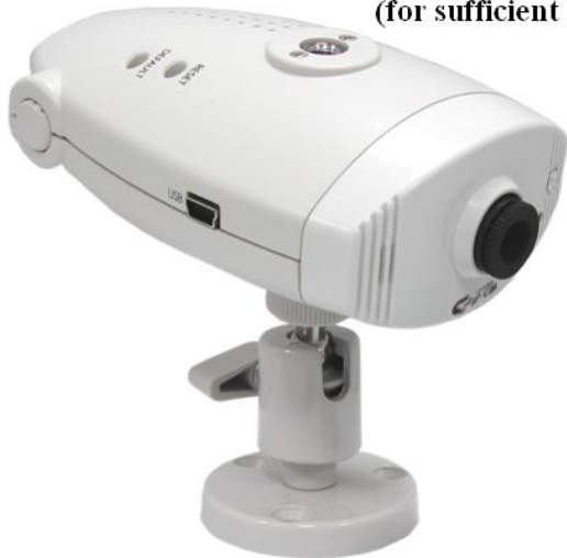
Non Night Version (for sufficient light)